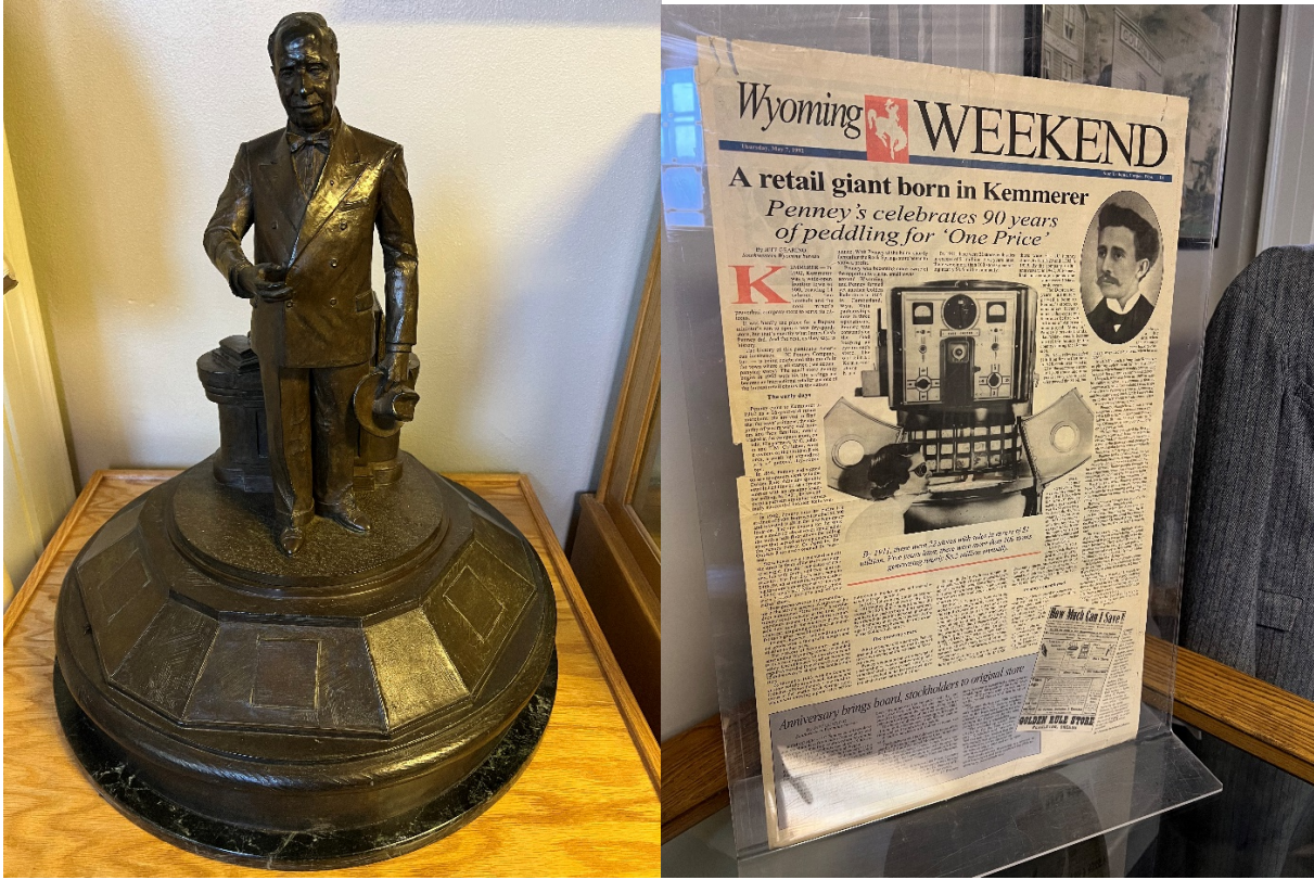
There is a small replica of Mr. Penney's statue as it looked in the Home Office in Plano, Texas. That same real statue is now located in Kemmerer's Triangle Park and is 9 feet tall and 4,000 lbs.! The picture above on the right was published in 1992 in the Star Tribune of Casper, WY and honors Mr. Penney's history and contributions to the state.