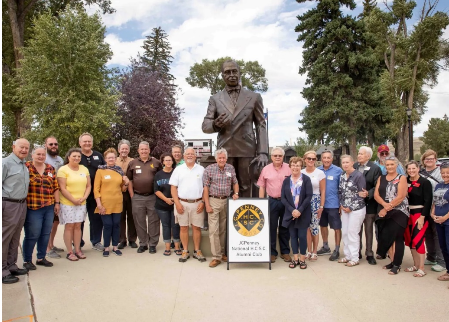
Pictured: HCSC Alumni Club reception attendees in front of Mr. Penney's statue which is 9 feet tall and weighs 4,000 lbs!

Save the Date! The 5 th Annual Golden Rule Days were held Thursday, August 21, 2025 in Triangle Park in Kemmerer, WY! All HCSC Alumni Club members are welcome to attend. Information about next year's event will be communicated via national email in May 2025!