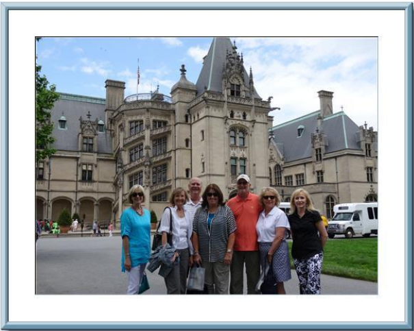
Visiting the Biltmore House