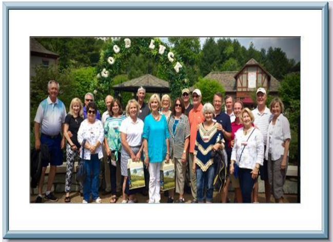
Antler Village and the Biltmore Winery