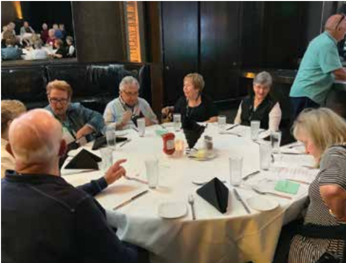
Lunch at 15L Restaurant