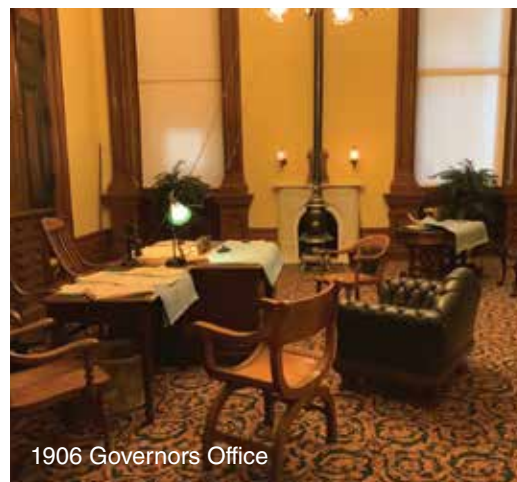
1906 Governors Office