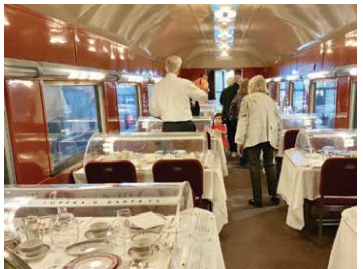
RR Museum Dining Car