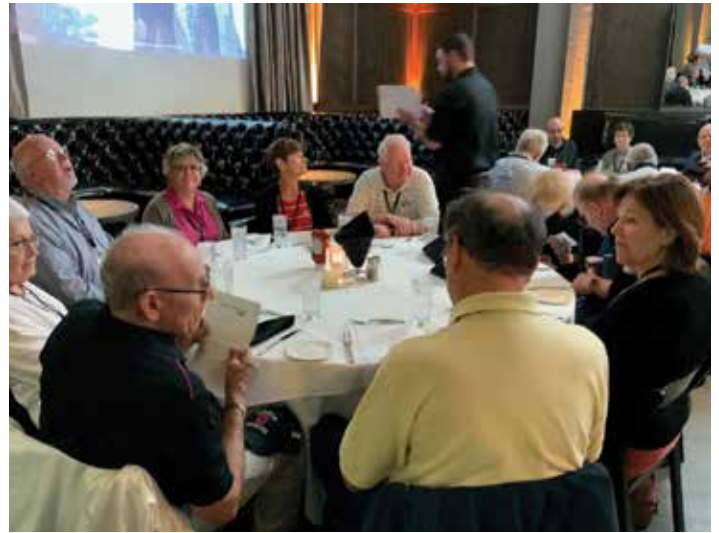
Lunch at 15L Restaurant