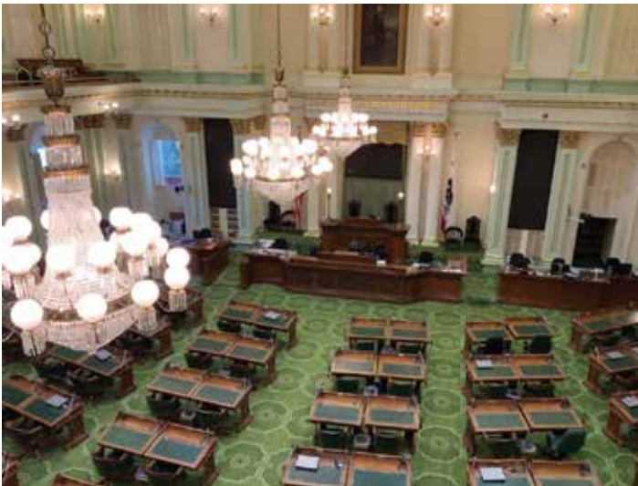
State Representatives Chamber