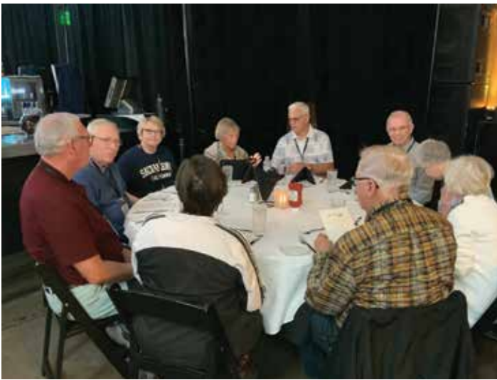
Lunch at 15L Restaurant