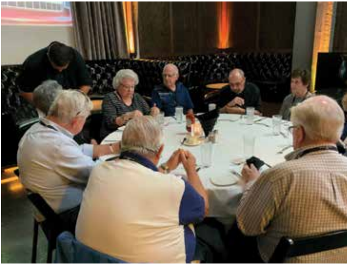
Lunch at 15L Restaurant