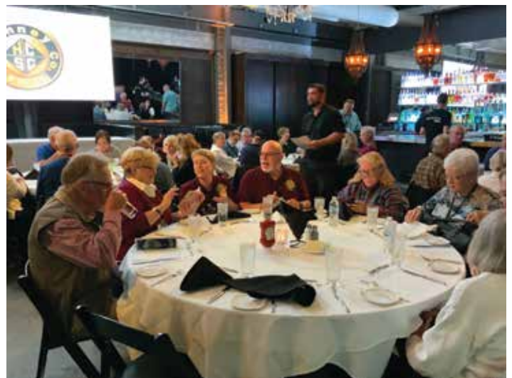
Lunch at 15L Restaurant