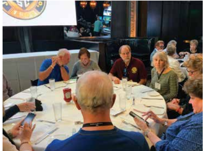
Lunch at 15L Restaurant