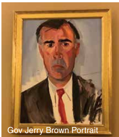
Gov Jerry Brown Portrait