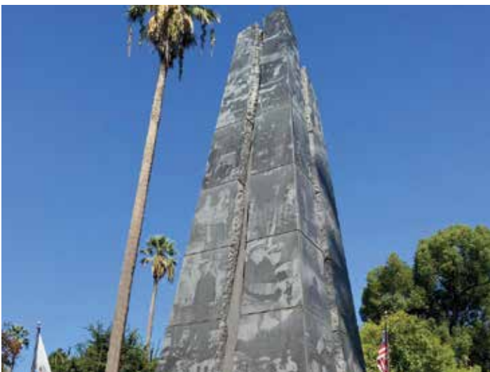
Monument at City Park